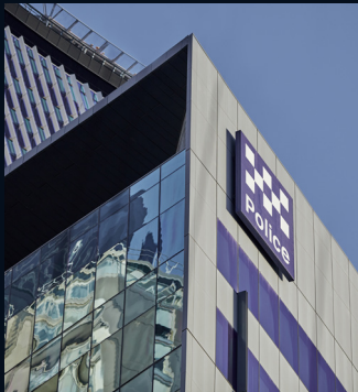
/ VICTORIA POLICE HEADQUARTERS MELBOURNE