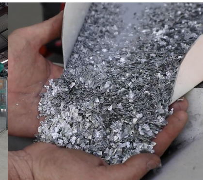
/ SEPARATED ELEMENTS ARE THEN BAGGED AND TRANSPORTED FOR REPURPOSING