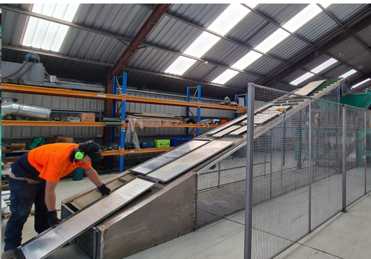
/ PANEL IS FED INTO THE ECOLOOP RECYCLING PROCESS