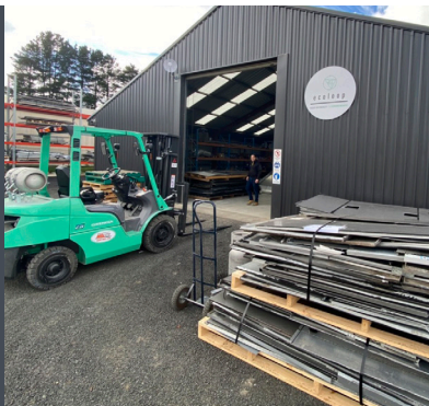
/ PANEL COLLECTED FROM SITE AND TRANSPORTED TO THE ECOLOOP FACILITY