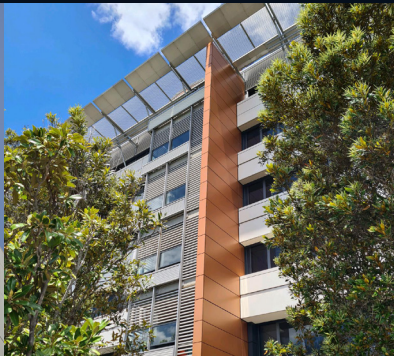
/ PRINCESS ALEXANDRA HOSPITAL BRISBANE