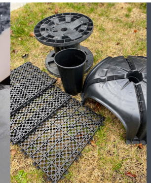
/ END USE EXAMPLES OF REPURPOSED MATERIAL