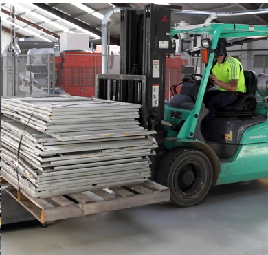
/ ALL WASTE PANEL IS WEIGHED FOR REPORTING PURPOSES